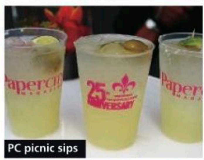
PC picnic sips